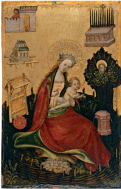
ANONYMOUS GERMAN ARTIST The Virgin and Child in the Hortus Conclusus , ca. 1410 Oil on panel, 28.6 × 18.5 cm Museo Thyssen-Bornemisza, Madrid, inv. no. 272 (1929.18.1)

THE THREAD THAT LINKS THE 12 PAINTINGS FROM THE THYSSEN Collection selected for this exhibition is the expression “hortus conclusus”, which appears in the Latin version of The Song of Songs. The word “hortus” translates into English as “garden”, while the adjective “conclusus” (“locked up” or “enclosed”) is actually a redundancy. By its very nature, a garden is enclosed, separate from the land around it and cultivated differently.